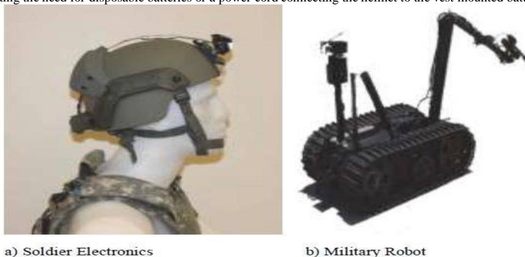
Fig.3 Highly resonant wireless charging system for Military applications.

Designers of defence systems are able to utilize wireless charging to improve the reliability, ergonomics, and safety of electronic devices. The Talon Teleoperated robot shown in Fig 3 is being equipped with wireless charging so that it can be recharged while it is being transported by truck from site to site. Helmet mounted electronics, including night vision and radio devices can be powered wirelessly from a battery pack carried in the soldier's vest, eliminating the need for disposable batteries or a power cord connecting the helmet to the vest mounted battery pack.